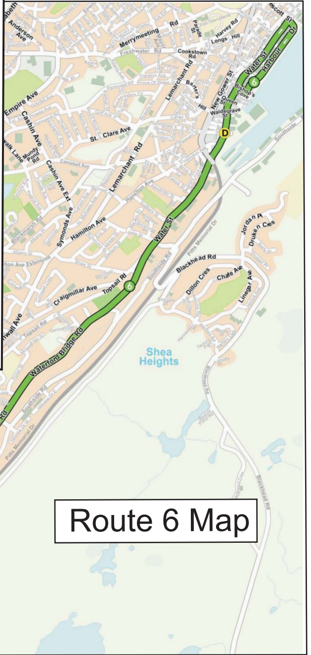
Route 6 Map